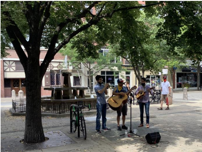
Giddings Plaza, Lincoln Square, Chicago, August 15.