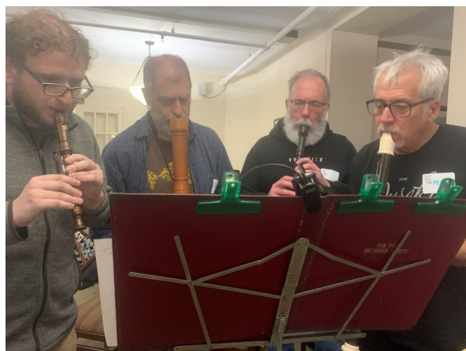
Practicing for December 6 at St. John's Episcopal