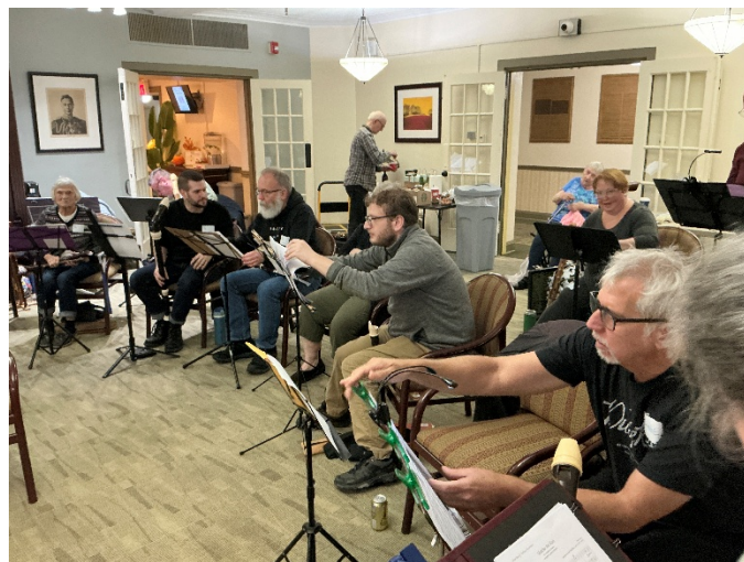
The Recorder Orchestra of the Midwest gathered in Brookfield on November 22